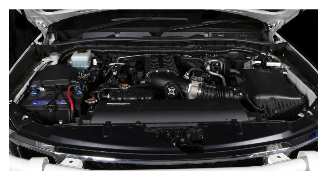
Harrop TVS2300 Supercharger kit installed on a 2016 Y62 Nissan Patrol

Power figures were measured on a Dynapack Hub Dyne.