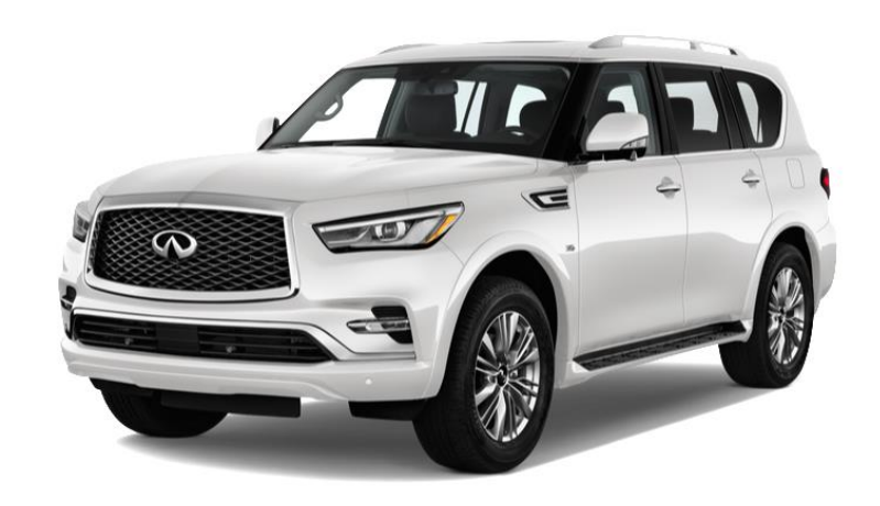
In development: 2010 – Present Infinity QX80