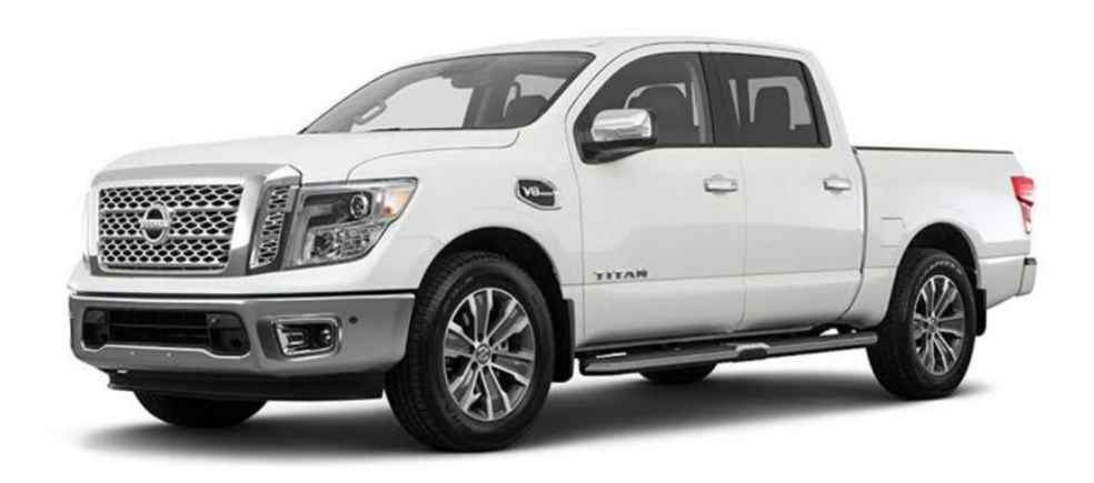
In development: 2016 – Present Nissan Titan