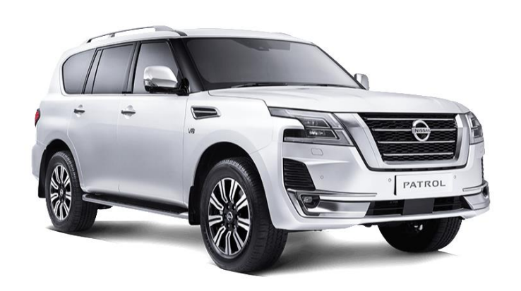
2010-Present Nissan Patrol Y62 (Armada Y62 in development)