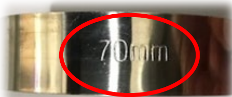
Throttle body inlet side