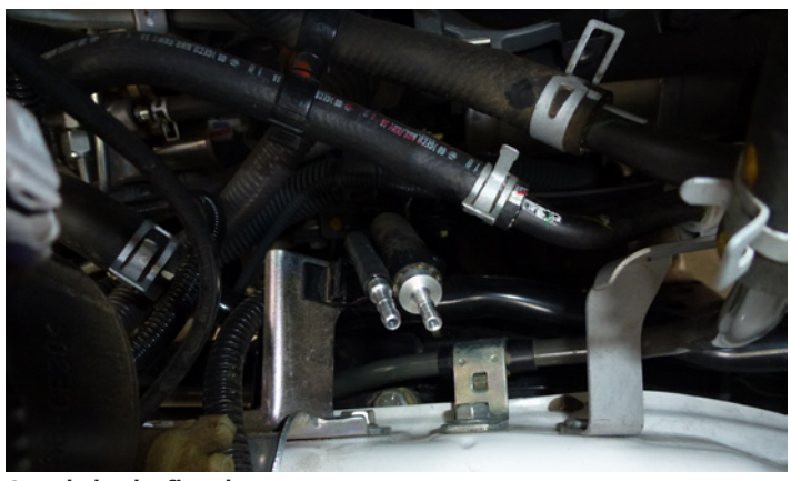
Supply barbs fitted