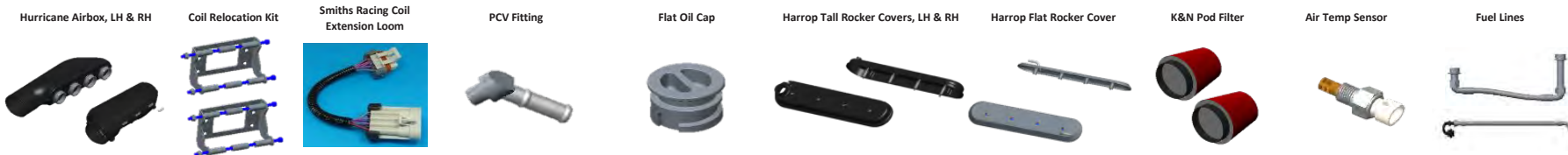
Hurricane Airbox Price Sheet: